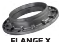
FLANGE X GROOVE ADAPTER