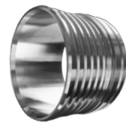
STAINLESS STEEL FITTING